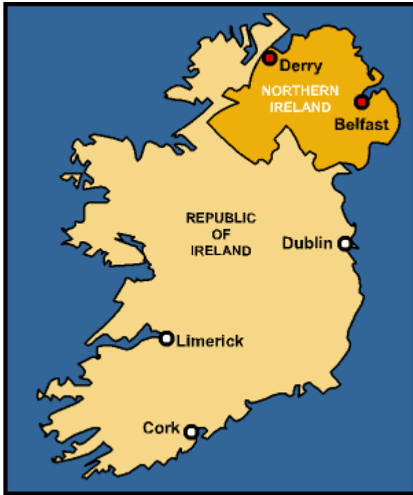
Illustration 1 – Derry, Northern Ireland