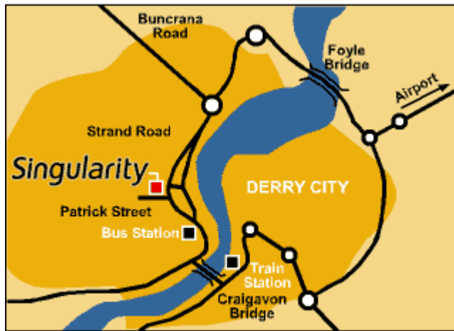
Illustration 2 – Singularity, Derry City