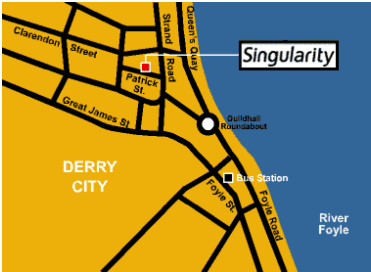
Illustration 3- Singularity, Derry City